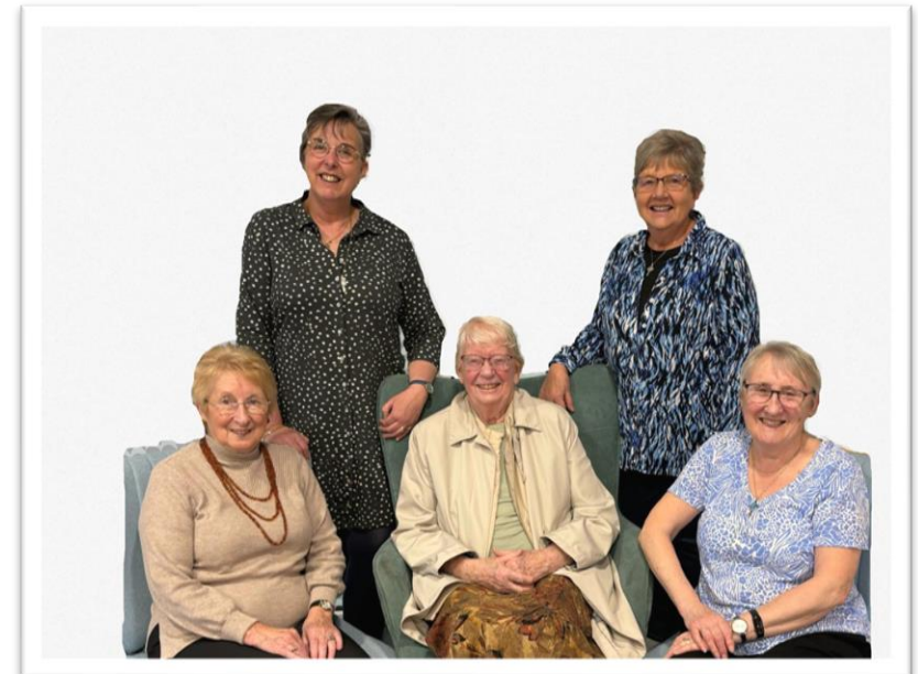
Our President and the four Vice Presidents

As the Archbishop of Canterbury said " Mothers' Union are the heart and love of the Church "