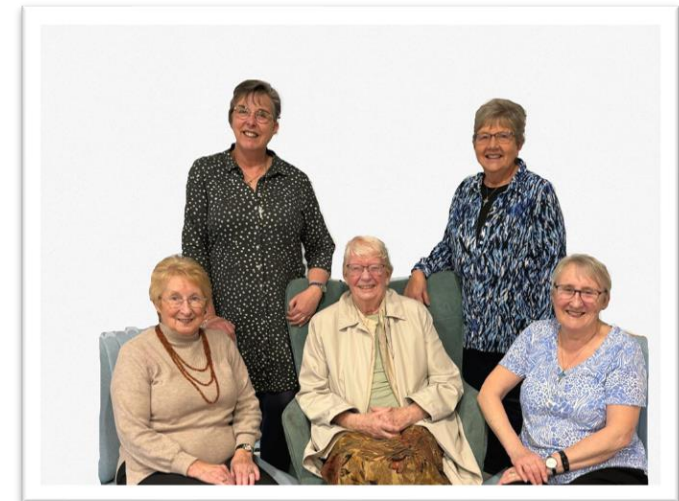
Our President and four Vice Presidents

We work through prayer and action both here and across the world. We hope you enjoy being part of our amazing world-wide network and participating in our many Diocesan projects, as well as enjoying the fellowship of monthly meetings Your ideas are also most welcome.