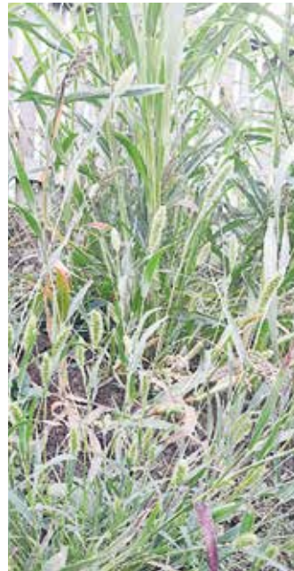
Grasses in our garden (the millet is beginning to go to seed!)

snow back in March was removed and we are now creating something of a rockery. The thoughts and plans were, of course, weather dependent, but patience seems to have worked even if some plants didn't make it. What has made me smile is a range of grasses that have appeared. I suspect the birds who enjoy the bird feeds in neighbours gardens are responsible. The grasses are all rather attractive and have helped to give us something to enjoy but I'm not so sure if it's been wise to let them seed themselves though. Only time will tell!