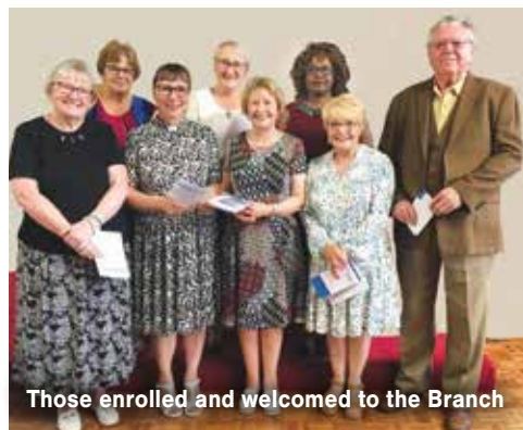
Those enrolled and welcomed to the Branch